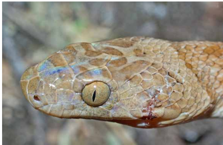
Figure 5. Trimorphodon tau with distinctive light collar on the neck. From Rancho La Ventana. This individual is very pale with a washed out pattern compared to the vividly patterned specimens from southeastern Sonora.

Many of our observations, although not extending the ranges or documenting new habitats used, help define the distribution of species for which there are few Sonoran specimens or localities, and/or distribution is poorly defined in east-central Sonora.