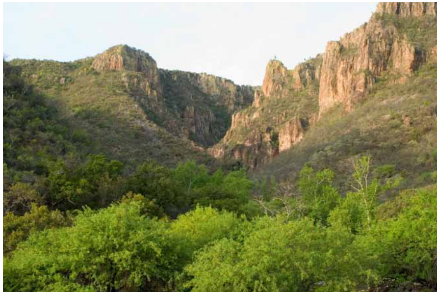
Figure 2. Arroyo Babisal just south of Rancho Babisal, Northern Jaguar Reserve. Vegetation is dry-season foothills thornscrub on the slopes and riparian in the canyon bottom.

the Río Sahuaripa) of that locality were determined through genetic analysis to be the morphologically similar Litobates magnaocularis (Oláh-Hemmings et al. 2009). In a personal communication to JCR, Julio Lemos Espinal reported a Heloderma horridum from near Sahuaripa (see Rorabaugh 2008), which is the northern-most record for that species.