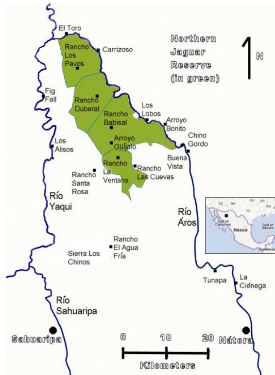
Figure 1. The Northern Jaguar Reserve and vicinity, which lies in east-central Sonora. The northern boundary of the Jaguar Reserve is 124 miles (200 km) SSE of the border at Douglas-Agua Prieta. Small inset: black dot marks general reserve location.

We made numerous trips to the Reserve and adjacent areas to search for amphibians and reptiles, often in the course of other work. CGG and MAGR are the resident reserve biologists, stationed in Sahuaripa, who frequent the Reserve. In July-August 2005, JEW participated in a biological inventory of the Ríos Aros and Yaqui (with a focus on major tributaries) from the town of Nátora on the Aros downstream for 115 river miles (184.8 river km) to El Río on the Yaqui, near the confluence with the Río Sahuaripa. That work included the portion of the Río Aros that forms the eastern boundary of the Reserve, as well as adjacent