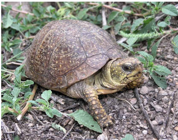
Figure 9. Terrapene nelsoni found inside a downed palm log at Rancho Las Cuevas.