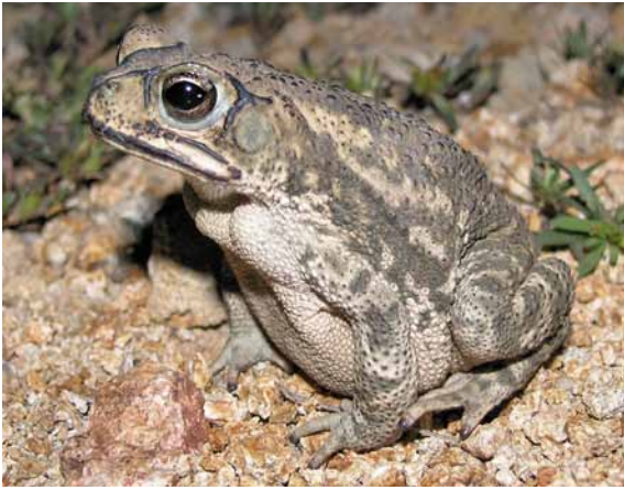
Figure 6. Incilius mazatlanensis from Rancho Los Pavos.