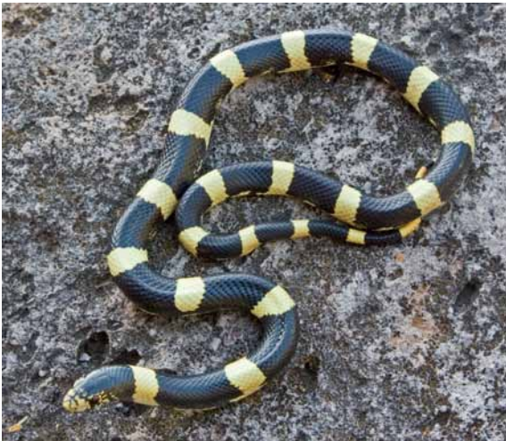
Figure 7. Rhinocheilus lecontei from Rancho Babisal. The other individual found at this locale had more red in the light bands, more closely resembling specimens from southern Sonora.

La Ventana and a reach 0.4 miles (0.6 km) southeast of Rancho La Ventana on the southern boundary of the Reserve have been assigned herein to L. magnaocularis . These determinations should be considered tentative and need to be confirmed through genetic analysis. The only such analysis conducted in the study area was on frogs collected at the confluence of the Ríos Yaqui and Sahuaripa, which were confirmed to be L. magnaocularis (Oláh-Hemmings et al. 2009).