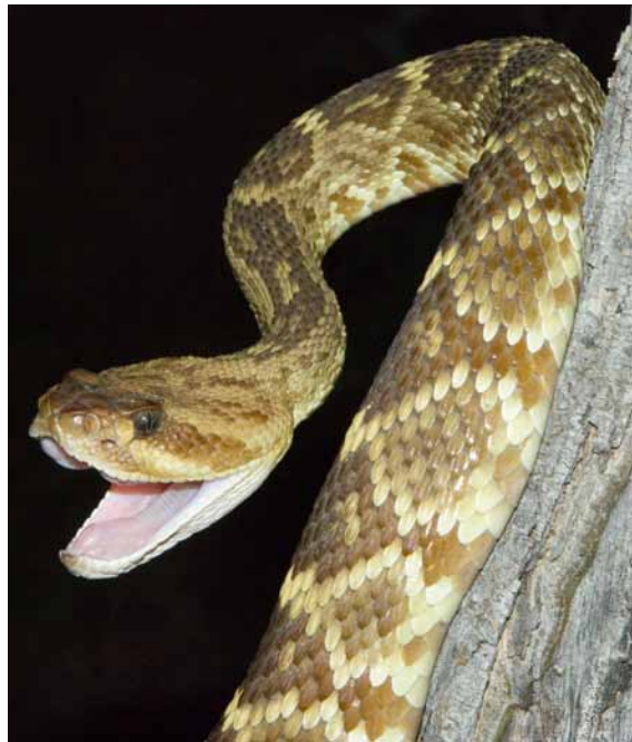
Figure 8. Crotalus molossus at Rancho Babisal. Although threatening, this individual was readjusting its jaws after its head had been pinned with a snake stick.