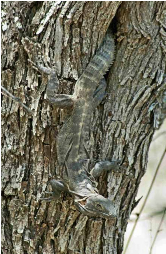
Figure 3. Adult Ctenosaura macrolopha emerging from a tree cavity near Rancho Dubaral.

4 We follow Devitt et al. (2008) in recognizing Trimorphodon lambda as a species separate from T. biscutatus .