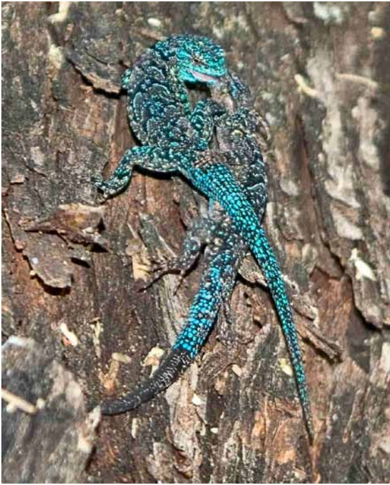
Figure 4: Exceptionally blue, male Urosaurus ornatus battling it out on a mesquite trunk in Arroyo La Ventana.

rus horridus , the closest records in Sonora are from La Poza (MZFC-UNAM 3885), which is about 17 miles (27 km) south of Hermosillo; and just east of San Nicolás on Highway 16 (MZFC-UNAM 15176). The Arroyo Santa Rosa record may represent a significant northeastern range extension; however, museum records include specimens of “ Sceloporus spinosus ” from “40 miles” (64 km) north of Hermosillo (CAS 89747) and the Sierra de Oposura (=Sierra de Madera, MCZ R-6763), which are significantly to the northwest and north of Rancho Santa Rosa, respectively. Sceloporus spinosus is a species of the Mexican Plateau that does not occur in Sonora, but is similar in appearance to S. horridus . These specimens would need to be examined before the lizard found at Arroyo Santa Rosa could be pronounced a range extension.